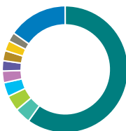
Geographic allocation (%)