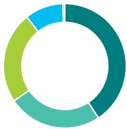
Asset allocation (%)