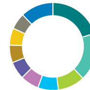
Sector allocation (%)