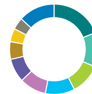
Sector allocation (%)