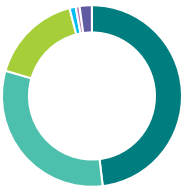
Asset allocation (%)