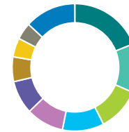
Sector allocation (%)