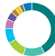
Sector allocation (%)