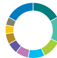
Sector allocation (%)