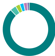
Geographic allocation (%)