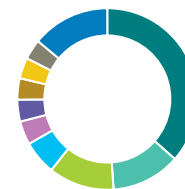
Sector allocation (%)