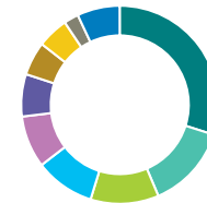
Sector allocation (%)