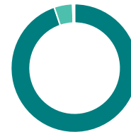
Sector allocation (%)